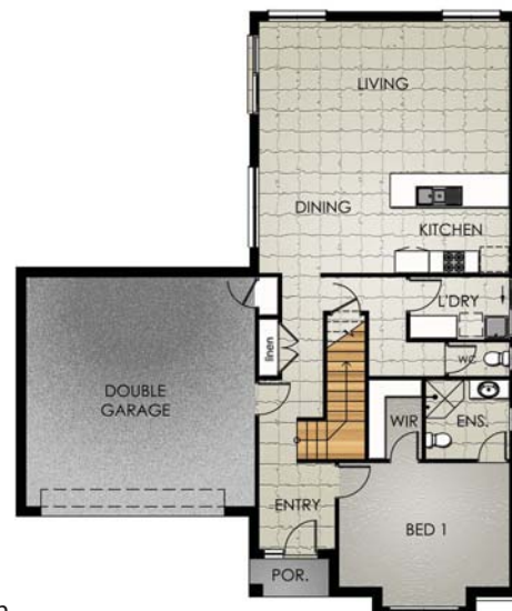
lower floor plan