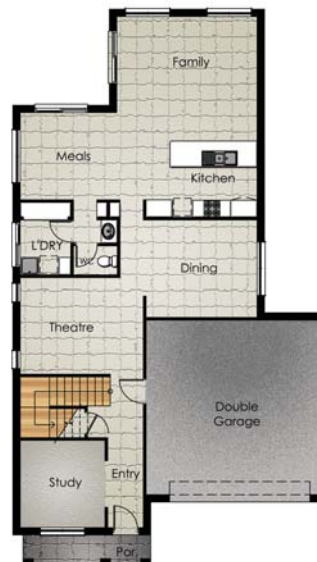
lower floor plan